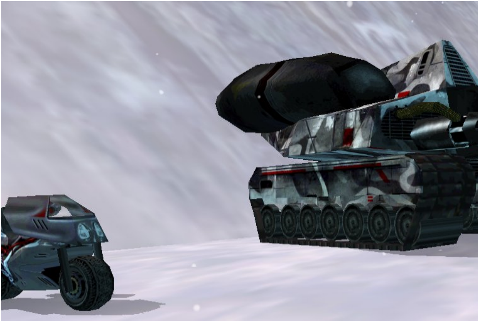
4) 4.jpeg , downloaded 1581 times