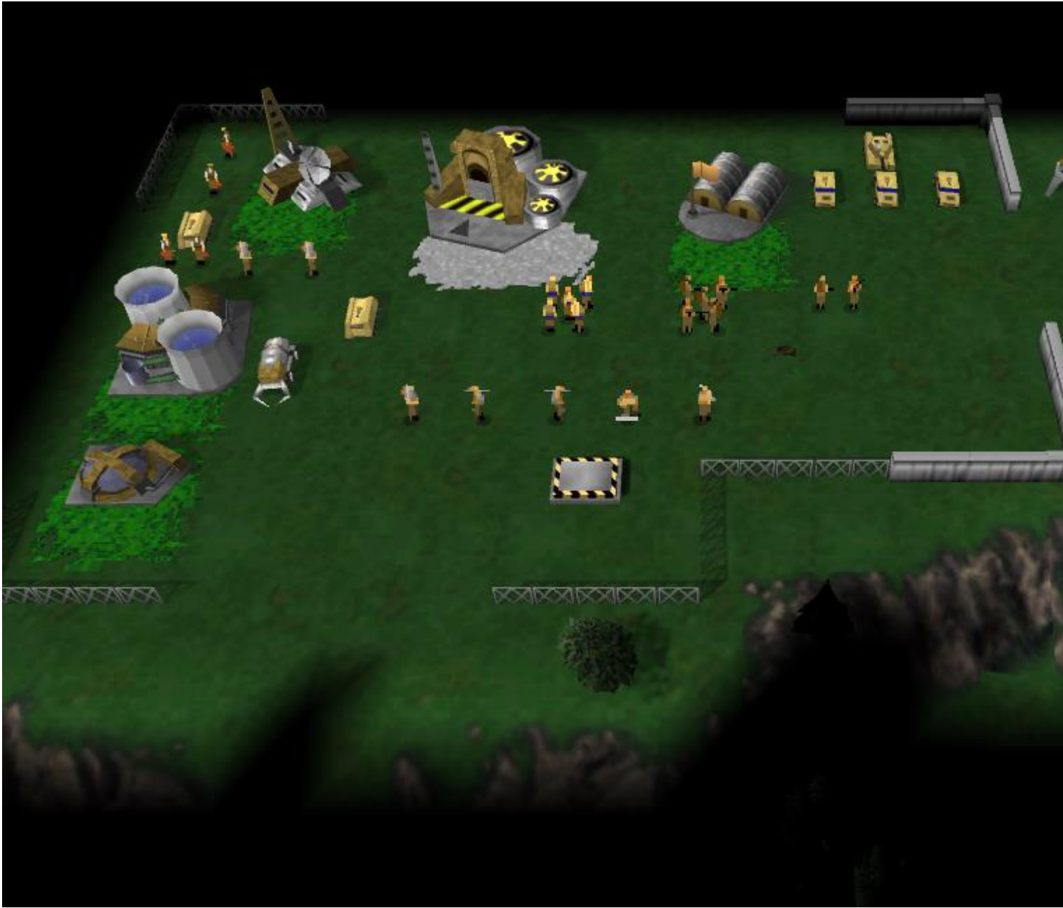
5) Gameplay03.PNG , downloaded 1985 times