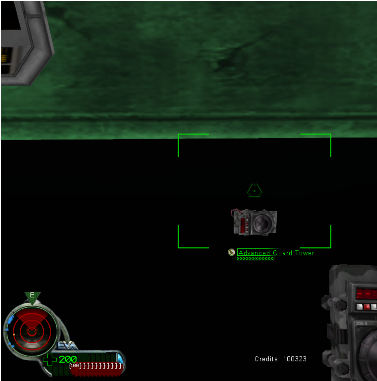
3) ScreenShot36.png , downloaded 954 times