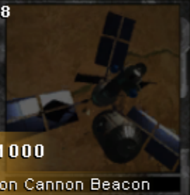
Ion Cannon Beacon