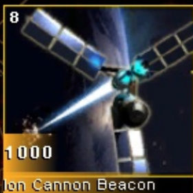
Ion Cannon Beacon