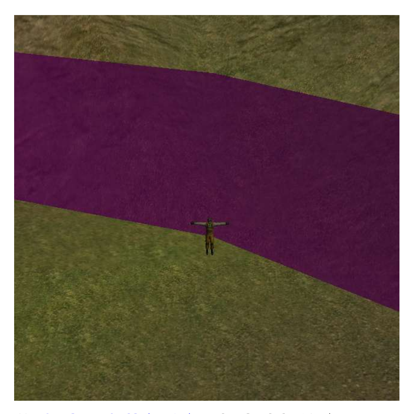
2) rf_volcano_buddyjump2.jpg, downloaded 516 times