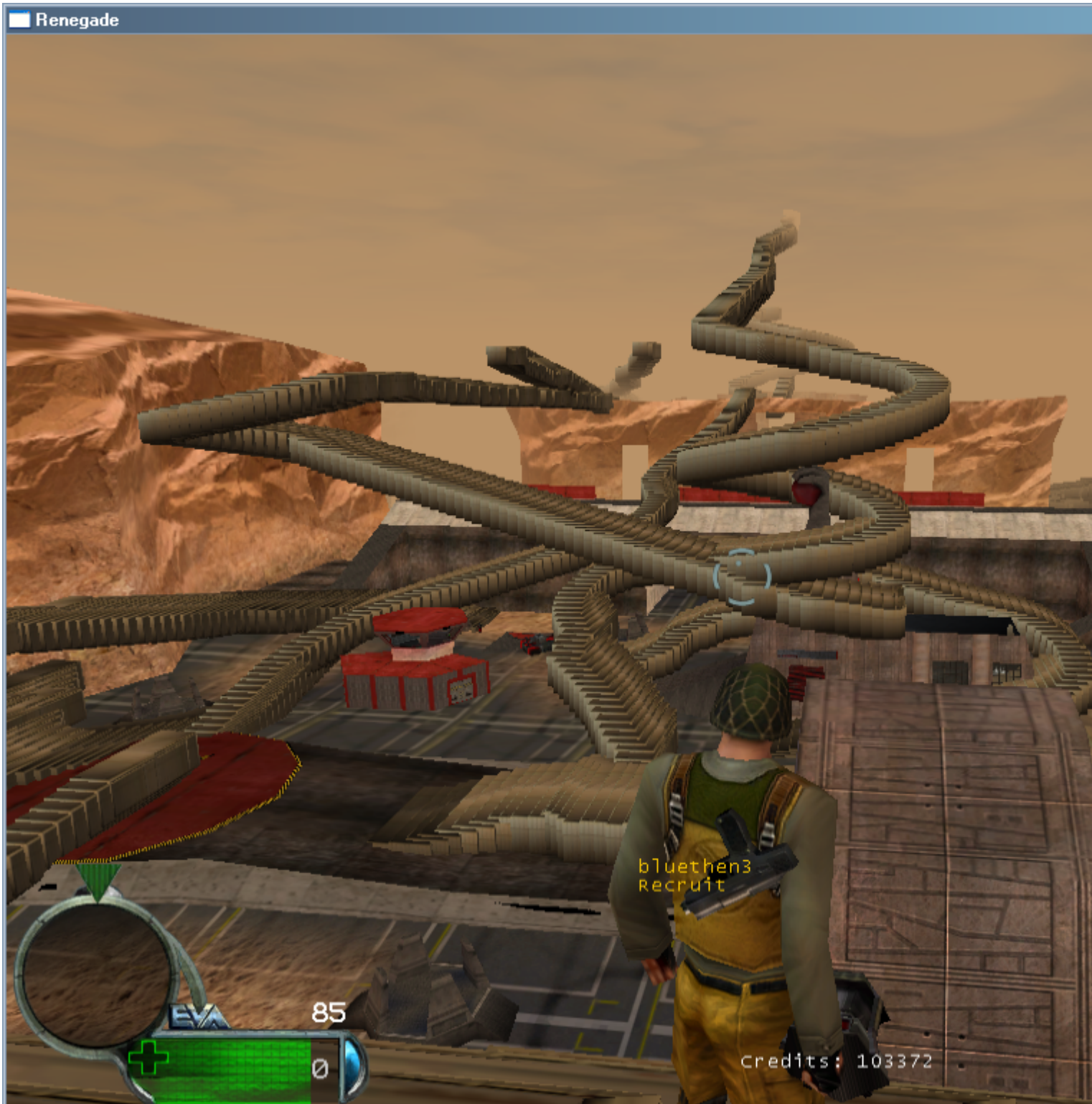
2) ScreenShot506.png , downloaded 374 times