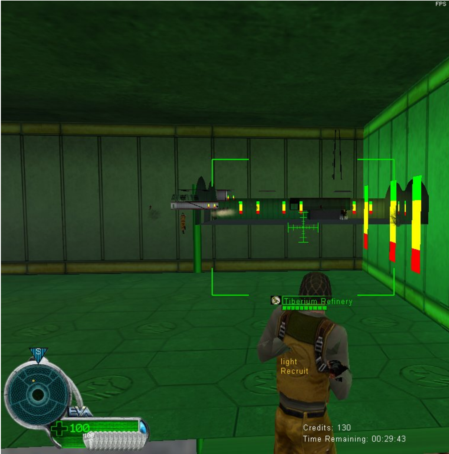
3) ScreenShot130.jpg , downloaded 633 times