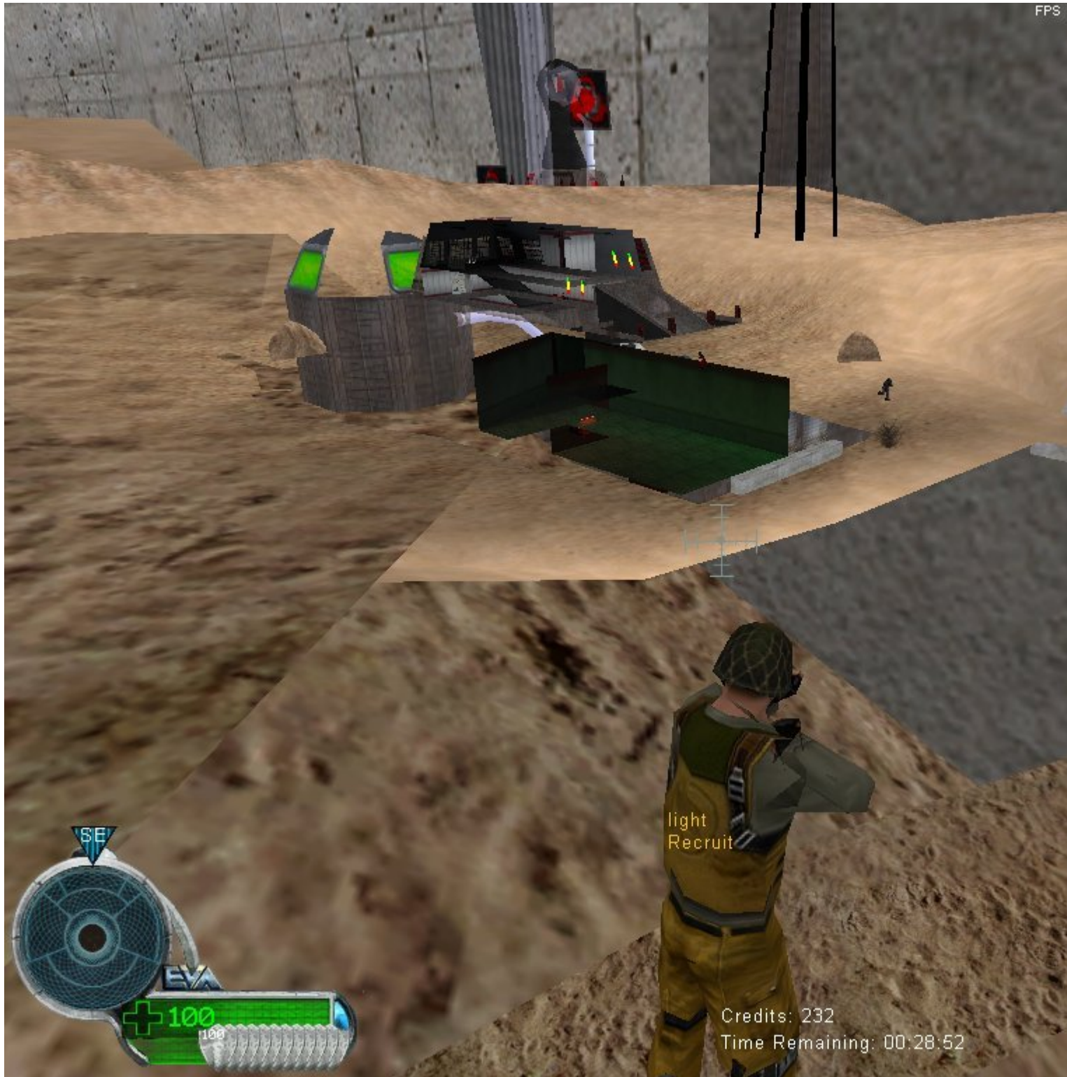
5) ScreenShot134.jpg , downloaded 647 times