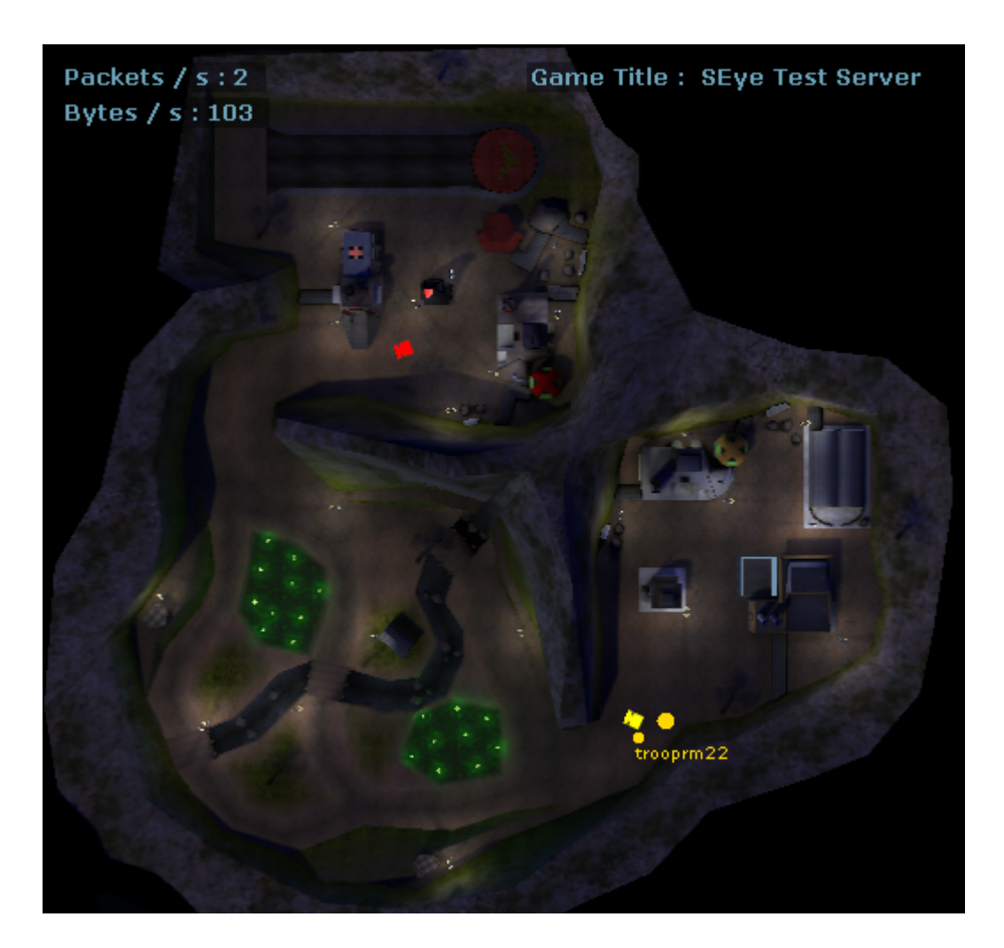
2) Thum-5-16-47.png, downloaded 935 times