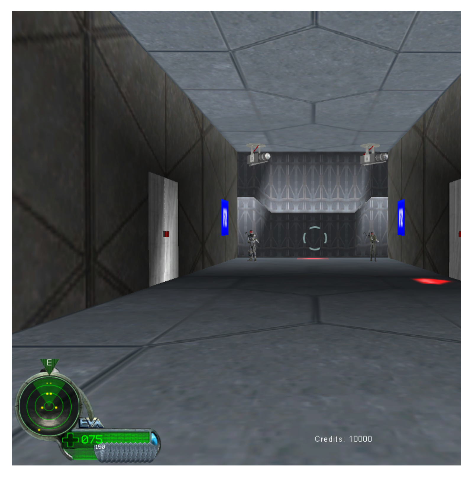
3) doorlayerthikness.png, downloaded 785 times