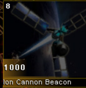
1000 Ion Cannon Beacon