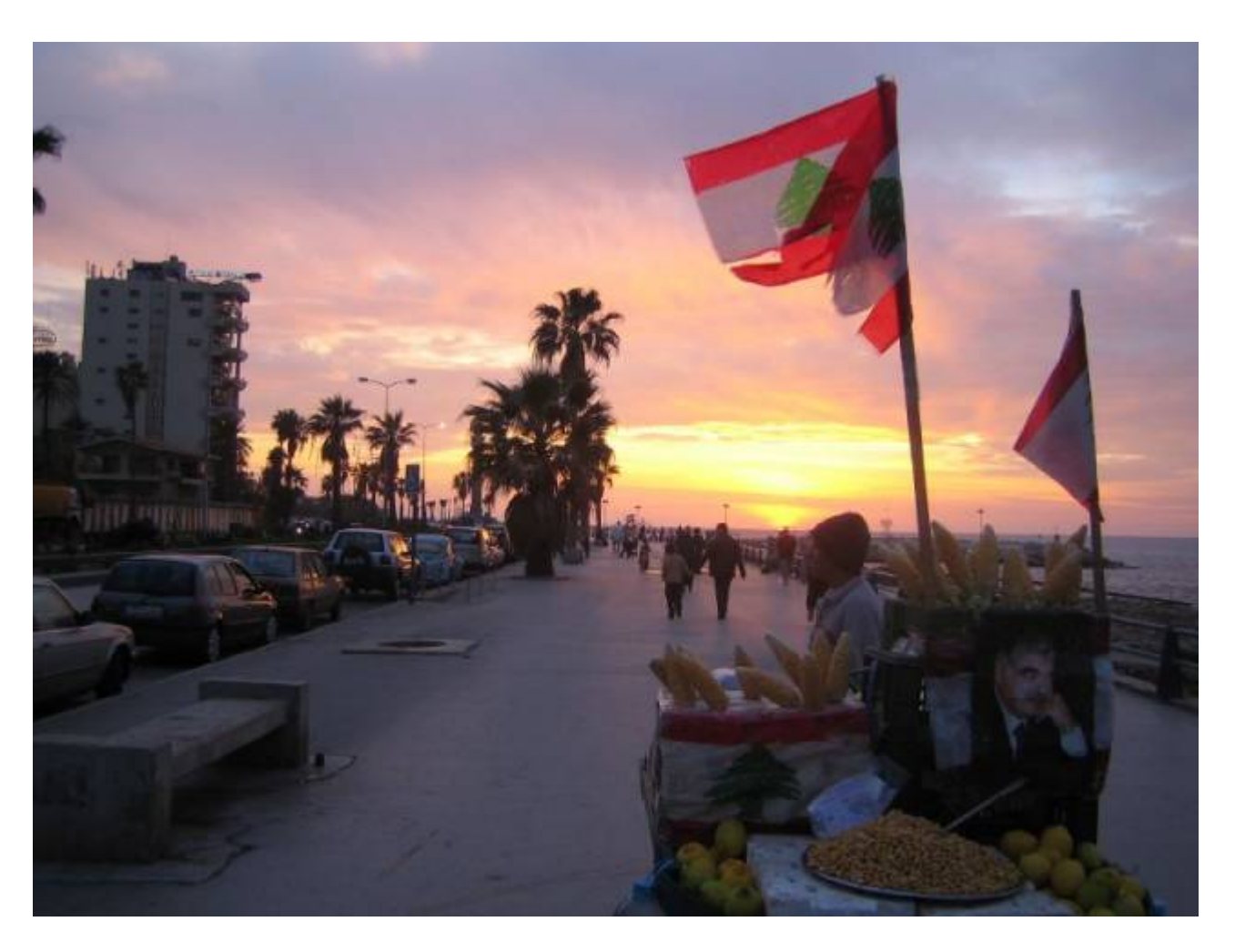
3) DSC01264.jpg, downloaded 262 times