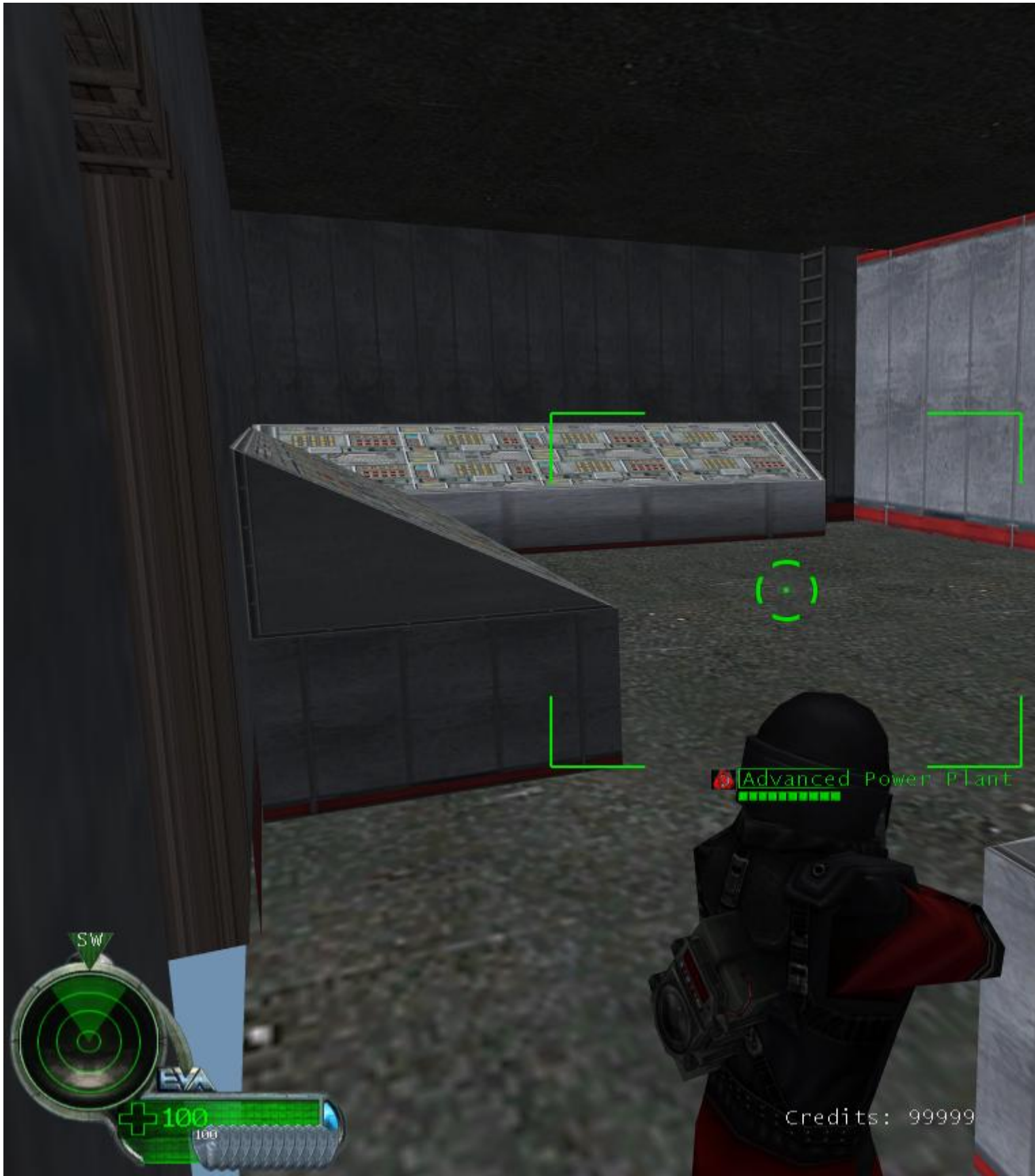
2) Advanced Power Plant Outside.JPG , downloaded 1017 times