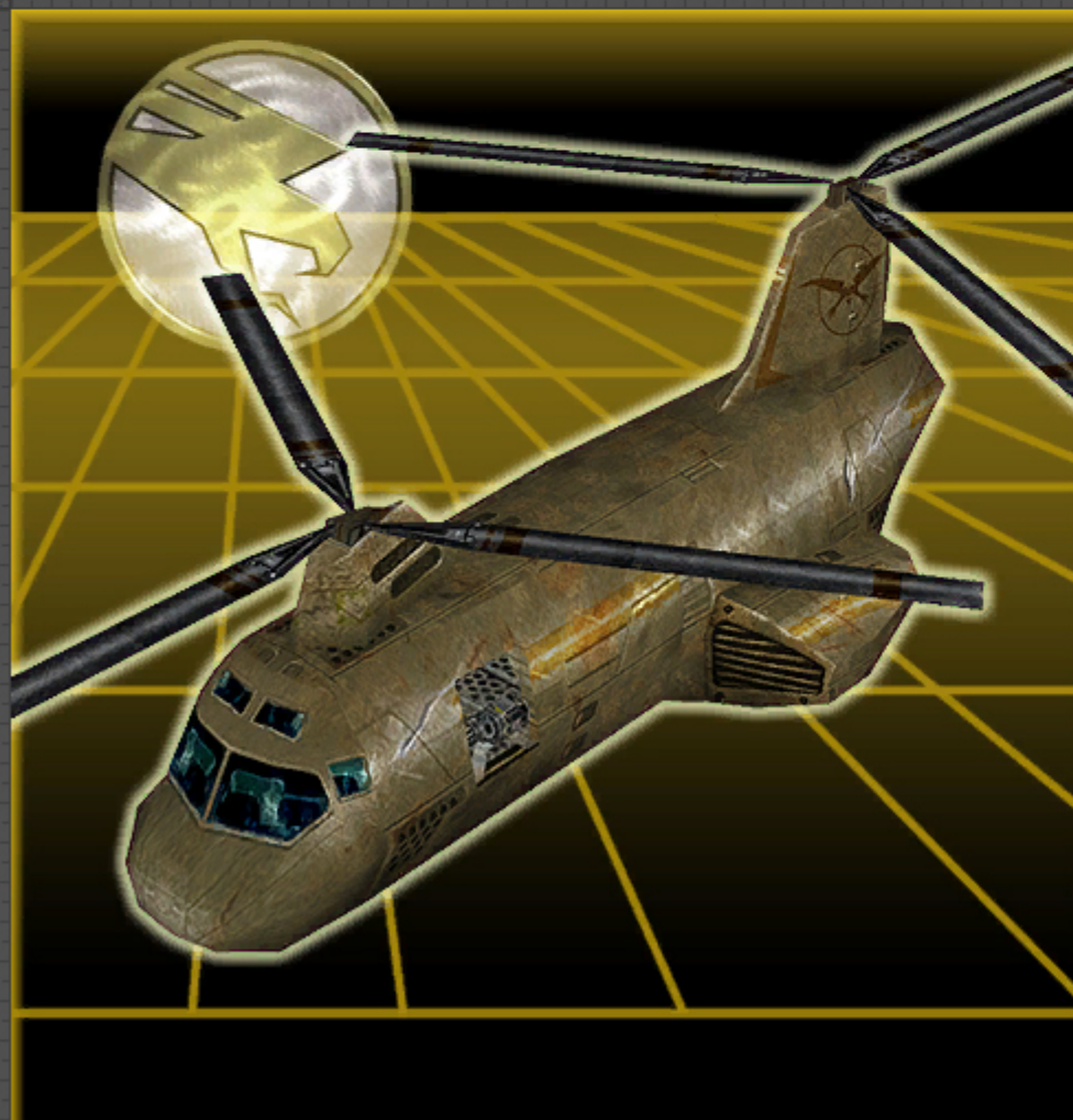
Ps hud_cnc_g_transport.dds @ 100% (RGB/8)