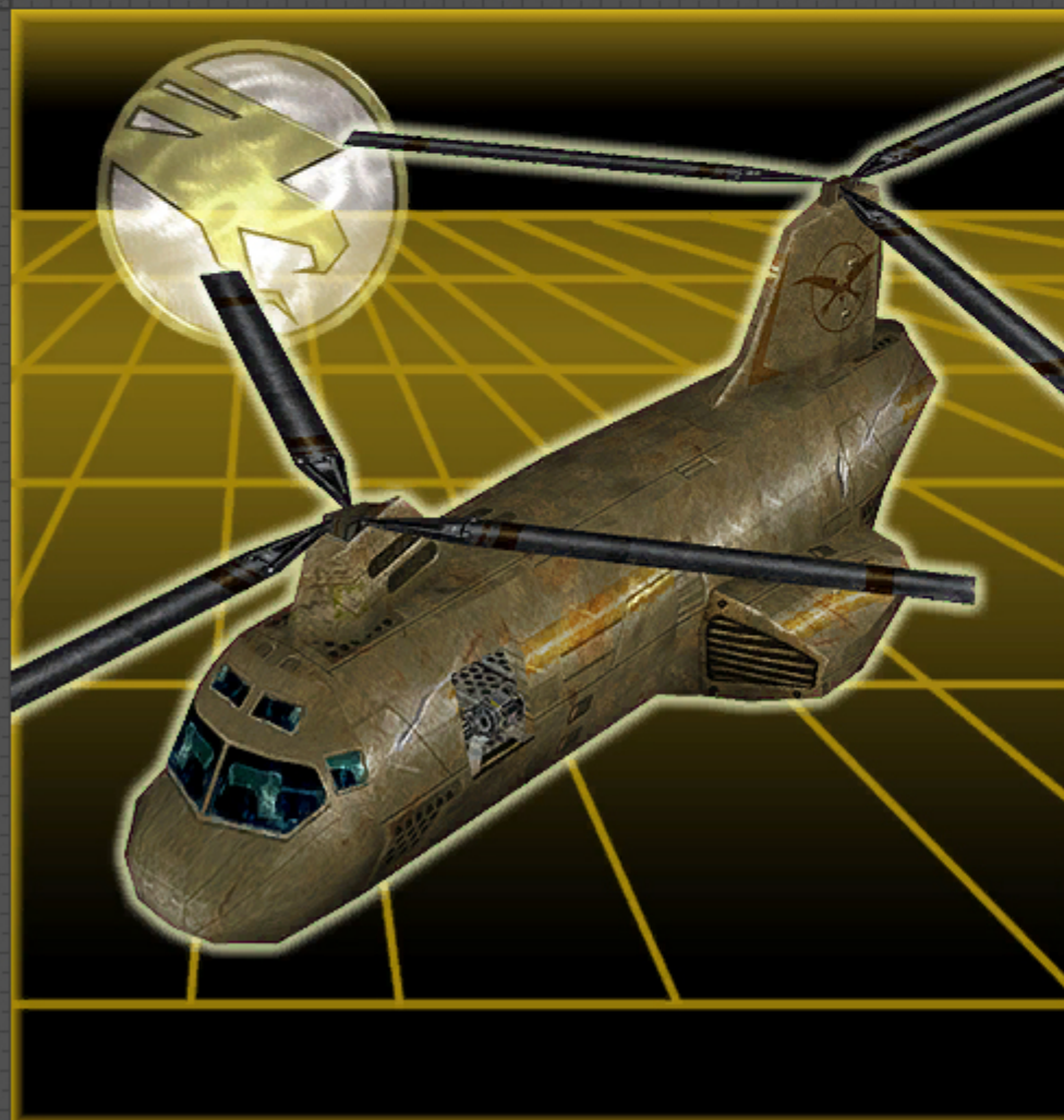
Ps hud_cnc_g_transport.dds @ 100% (RGB/8)