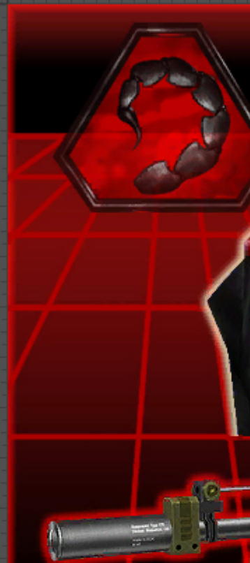
Ps hud_cnc_gmobiusion2.dds @ 100%