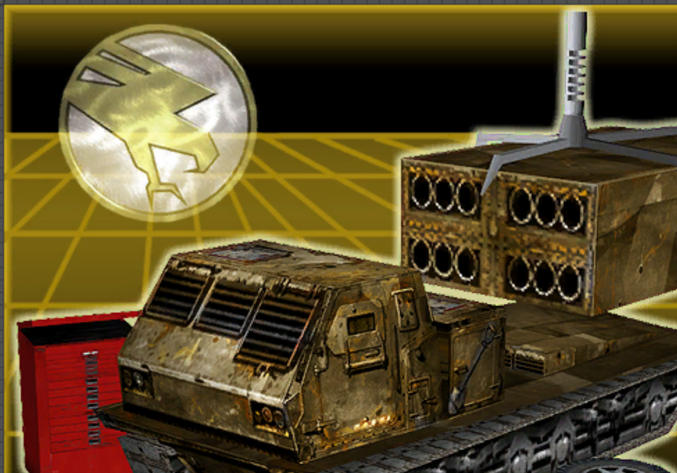
Ps hud_cnc_g_transport.dds @ 100% (RGB/8)